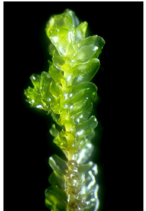
Stolonivector fiordlandiae. Photographer: Bill Malcolm, Licence: All rights reserved.