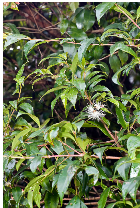
Hutt River Trail near Belmont. Photographer: Jeremy R. Rolfe, Date taken: 27/03/2011, Licence: CC BY.