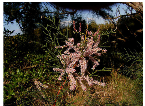
Mianda.