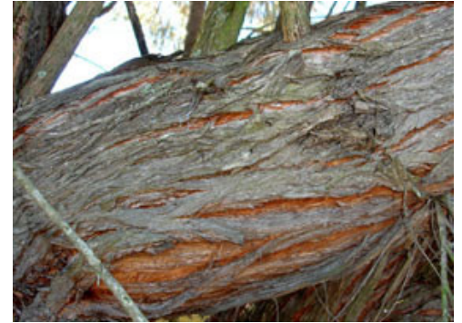
The bark of Taxandria juniperina, Dover Road, St Andrews, Hamilton. Date taken: 07/05/2006, Licence: CC BY-NC.