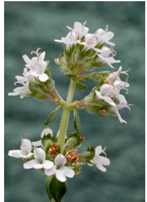
In cult. ex Clyde. Nov 2008.