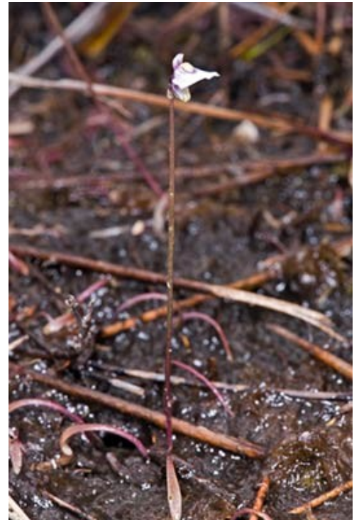
Karikari Peninsula. Oct 2008.