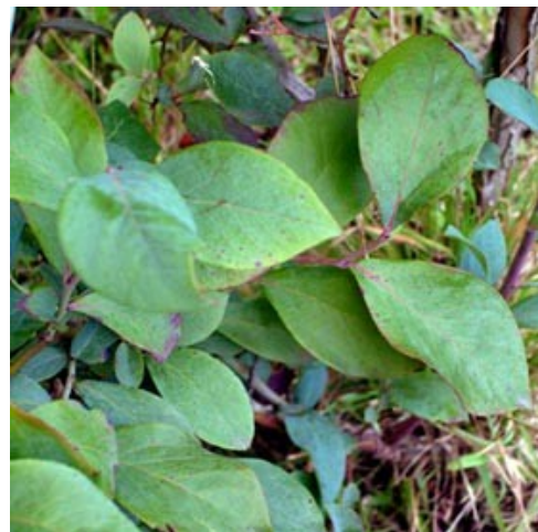
Tairua Estuary. Mar 2008.