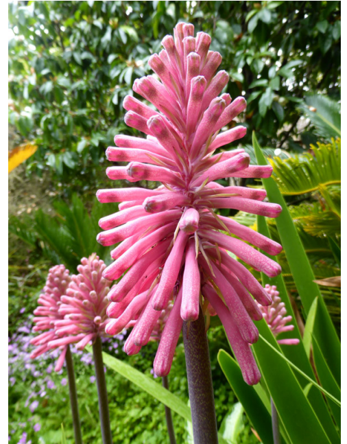
Inflorescence with flower buds close to opening; garden, Whanganui. Photographer: Colin C. Ogle, Date taken: 25/09/2015, Licence: CC BY-NC.