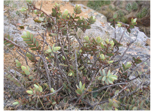
Hebe amplexicaulis f. amplexicaulis, Mt Somers.