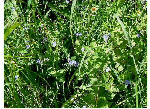
Veronica chamaedrys.