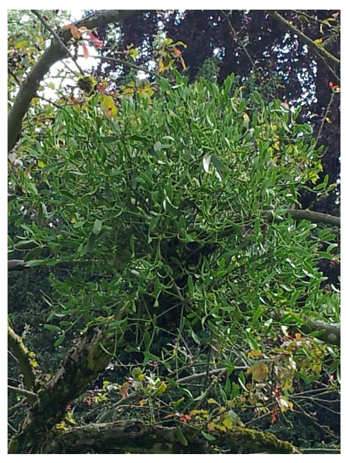
On apple, Strasbourg, France. Jun 2013.