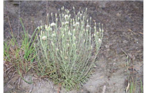
Vittadinia gracilis.