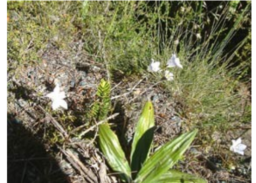
Mangatepopo, January.