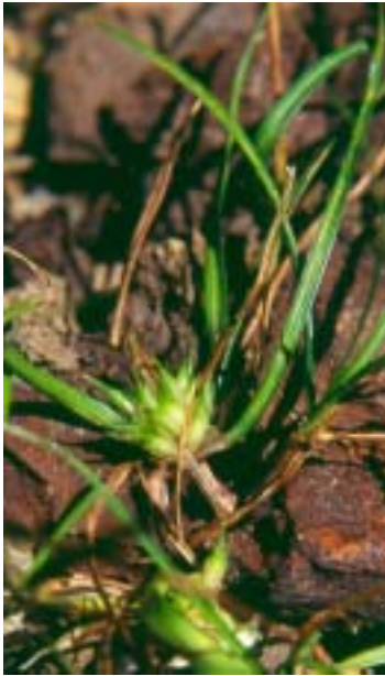
Immature fruit

Grassy mat sedge is one of five threatened grassy plants included in a national recovery plan. They all grow in dry fertile sites in the eastern South Island. These places may be used for farming, quarrying or recreation and are also often of significance to Māori. Hopefully with collaboration between all those involved it will be possible to find compatible ways of managing these places. A first step towards this is helping people recognise the plants.