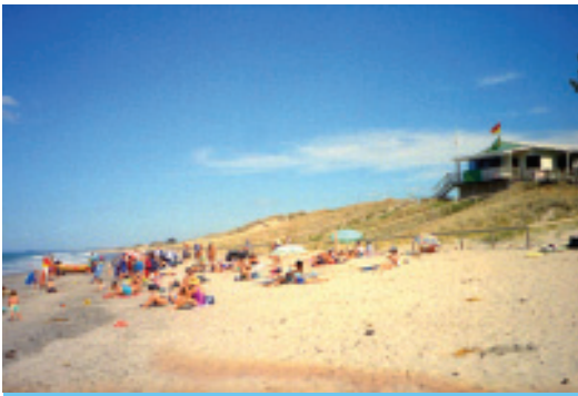
Papamoa Domain Coastal Protection. Native coastal plants protect dunes. Good dunes = Great beach