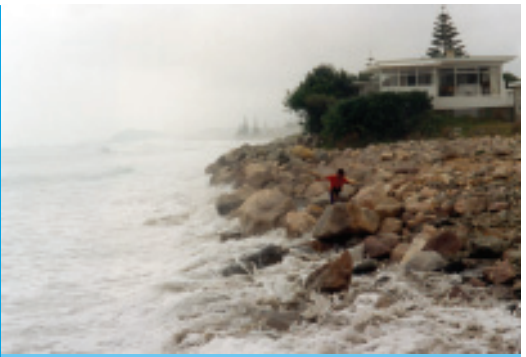
Shaw Road, Waihi Beach Coastal Protection No dunes = No beach