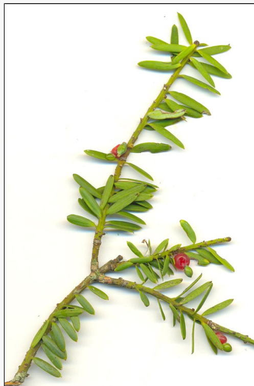
Caption: Seeds of Podocarpus totara var. totara