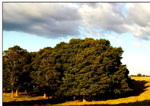
Caption: Podocarpus totara var. totara at Pokemokemoke

http://nzpcn.org.nz/flora_details.asp?ID=1176