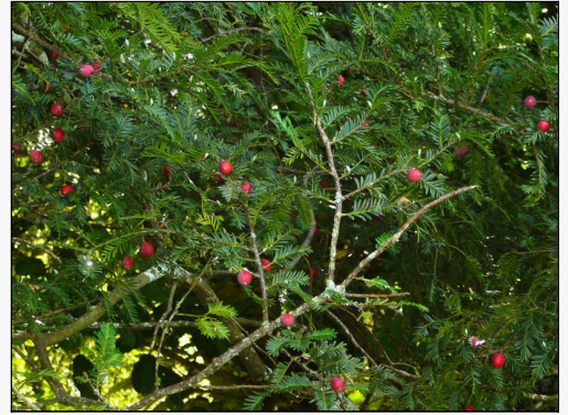
Caption: Seeds of Prumnopitys ferruginea