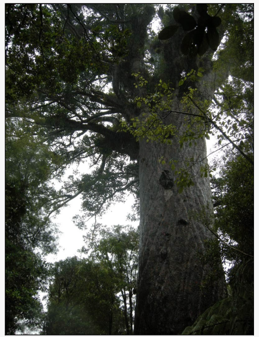
Caption: Waipoua Forest, Northland - Tane Mahuta

http://nzpcn.org.nz/flora_details.asp?ID=2047