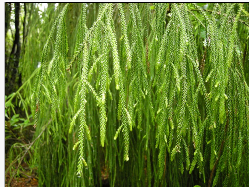
Caption: Pihanga, Tongariro National Park