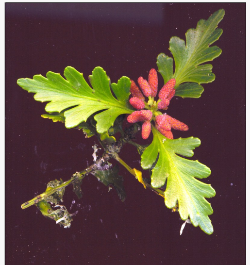
Caption: Catkins of Phyllocladus trichomanoides