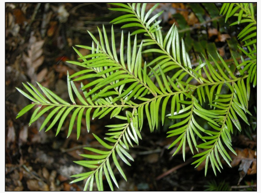
Caption: Ruahine Range

http://nzpcn.org.nz/flora_details.asp?ID=794