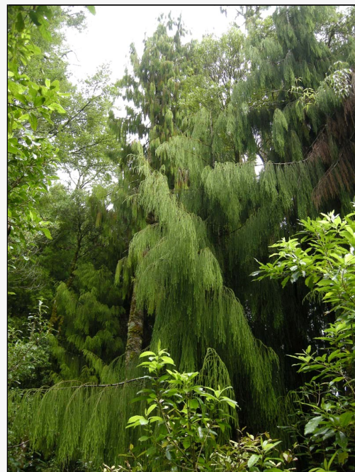
Caption: Pihanga, Tongariro National Park

http://nzpcn.org.nz/flora_details.asp?ID=2100