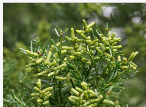
Caption: Cones of Prumnopitys taxifolia (male)