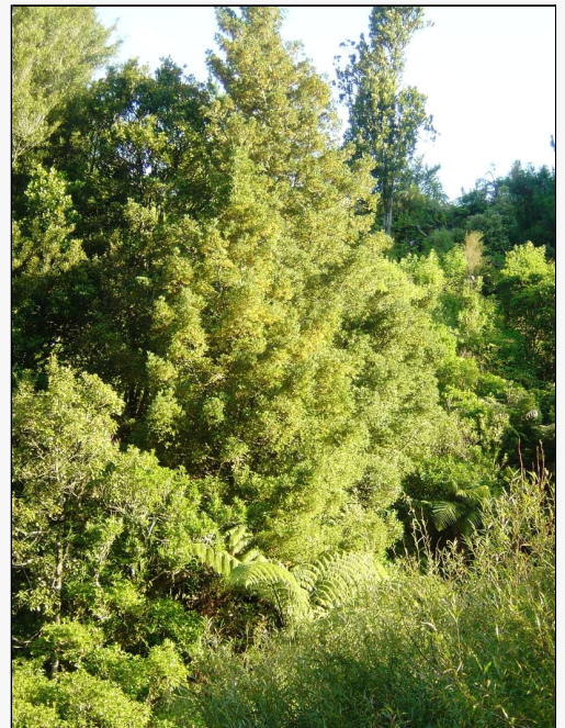
Caption: Phyllocladus trichomanoides (Tanekaha)

http://nzpcn.org.nz/flora_details.asp?ID=1117