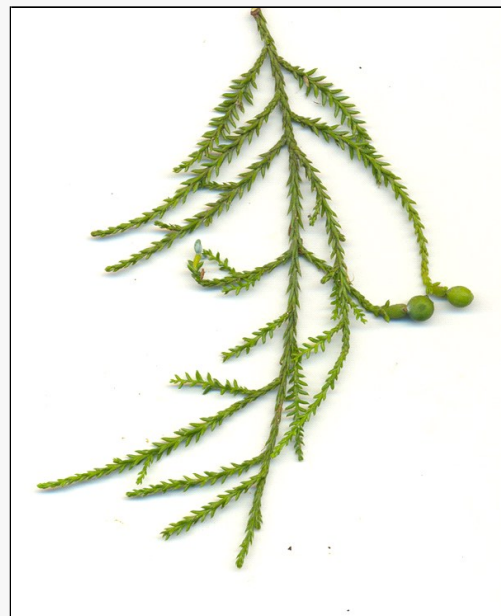
Caption: Dacrycarpus dacrydioides