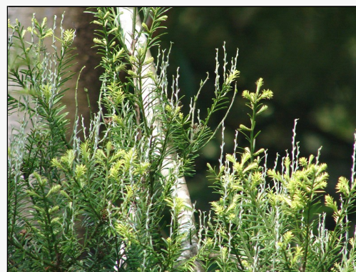
Caption: Matai with female cones

http://nzpcn.org.nz/flora_details.asp?ID=1193