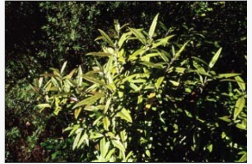
Caption: Corokia buddleioides , Mt Donald McLean