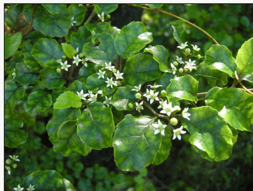
Caption: Rotoiti Mainland Island, Nelson Lakes National Park