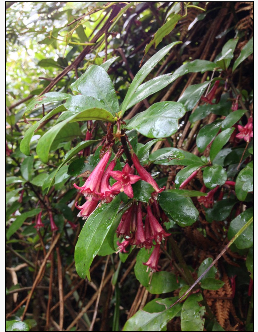
Caption: Kaikmai Range