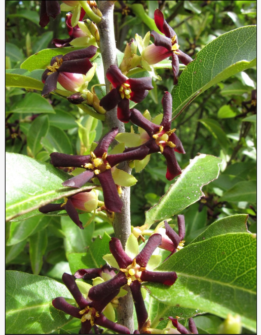
Caption: Quail Island