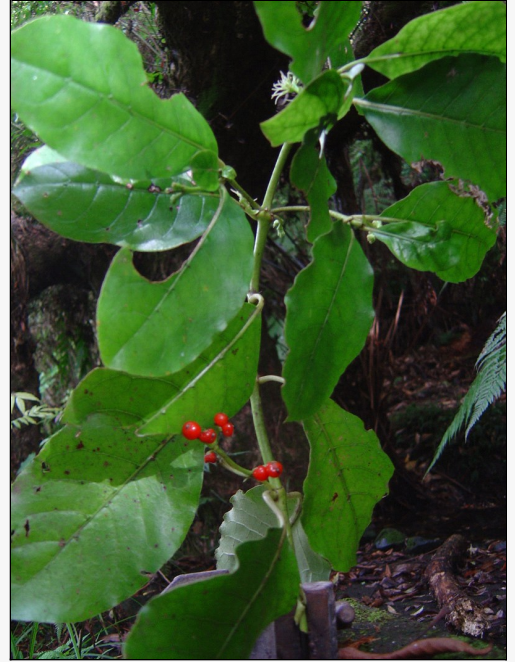
Caption: Coprosma grandifolia