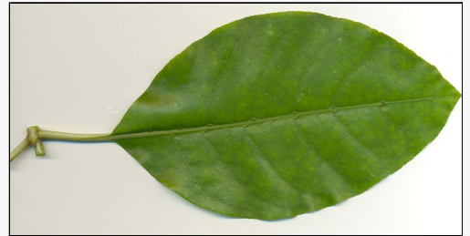
Caption: Leaf of Coprosma grandifolia

http://nzpcn.org.nz/flora_details.asp?ID=1717