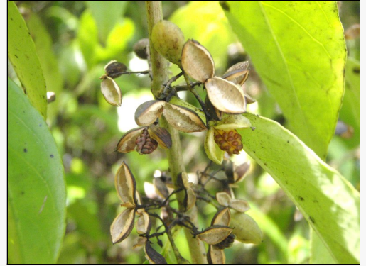
Caption: Puketi Forest, Northland