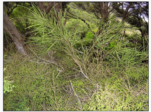
Caption: Carmichaelia australis

http://nzpcn.org.nz/flora_details.asp?ID=1596