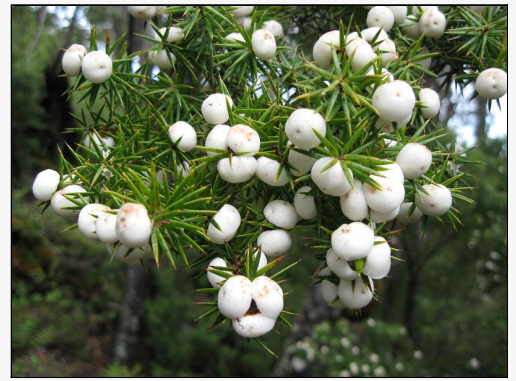
Caption: Coal Island

http://nzpcn.org.nz/flora_details.asp?ID=907