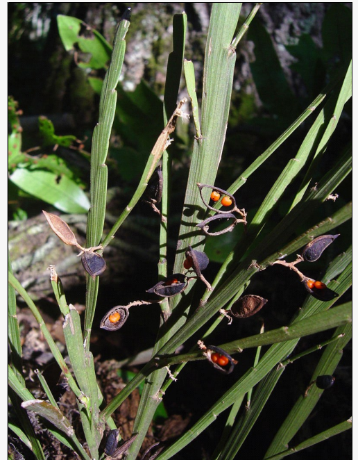
Caption: Carmichaelia australis