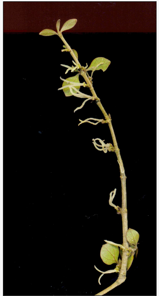
Caption: Coprosma rhamnoides (female)

http://nzpcn.org.nz/flora_details.asp?ID=1731