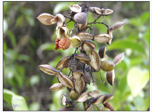
Caption: Puketi Forest, Northland

http://nzpcn.org.nz/flora_details.asp?ID=1923