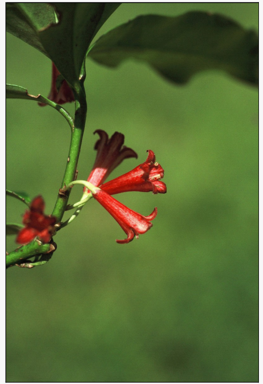
Caption: Kauaeranga Valley Photographer: Peter de Lange

http://nzpcn.org.nz/flora_details.asp?ID=1488