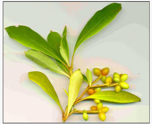
Caption: Coprosma lucida

http://nzpcn.org.nz/flora_details.asp?ID=1719