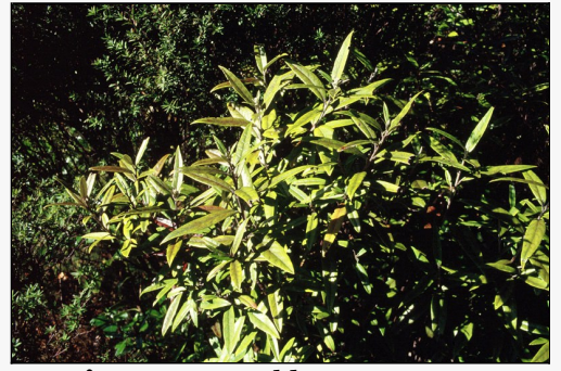
Caption: Mt Donald McLean

http://nzpcn.org.nz/flora_details.asp?ID=1755