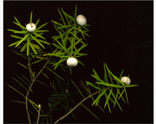
Caption: Leptecophylla juniperina subsp. juniperina