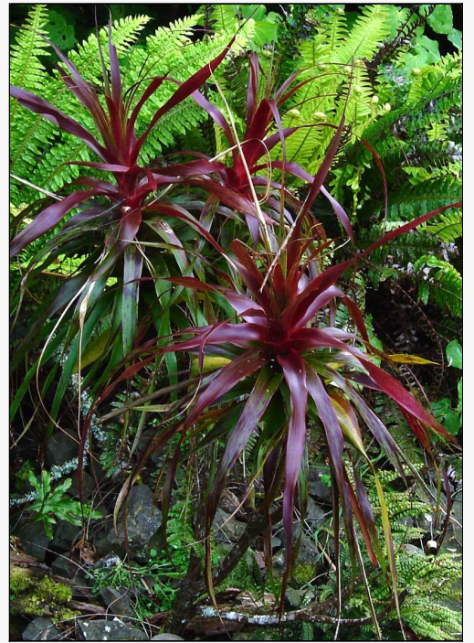
Caption: Dracophyllum latifolium

http://nzpcn.org.nz/flora_details.asp?ID=1803