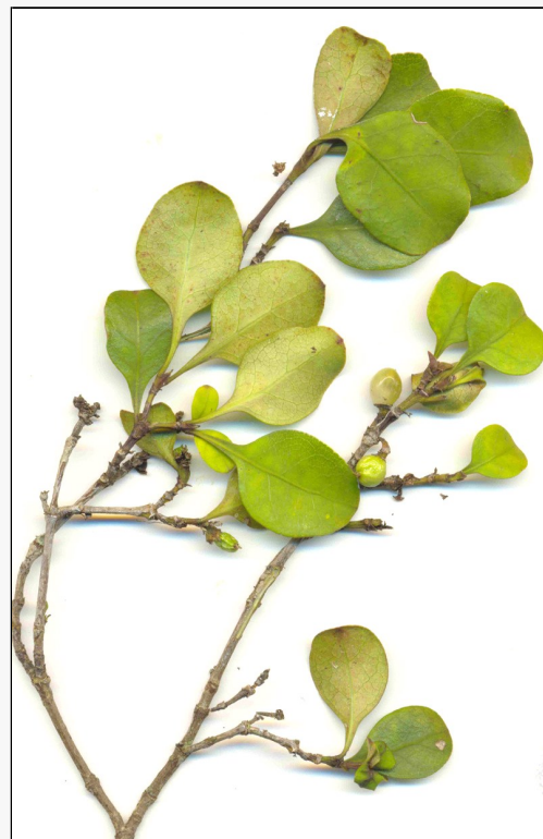
Caption: Coprosma arborea (Mamangi)

http://nzpcn.org.nz/flora_details.asp?ID=2306