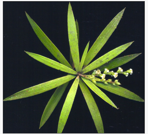
Caption: Flowers of Leucopogon fasciculatus

http://nzpcn.org.nz/flora_details.asp?ID=925