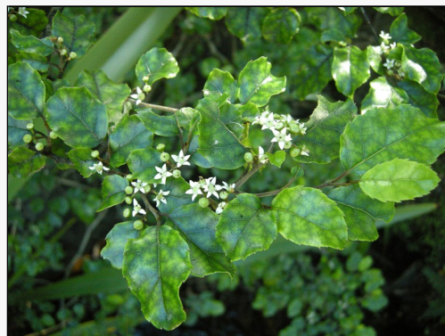
Caption: Rotoiti Mainland Island, Nelson Lakes National Park

http://nzpcn.org.nz/flora_details.asp?ID=1605