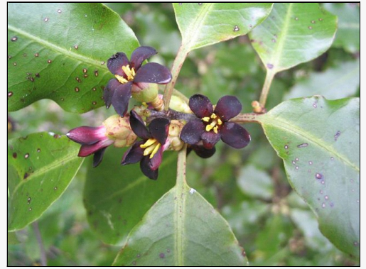
Caption: Pittosporum tenuifolium in flower Dunedin

http://nzpcn.org.nz/flora_details.asp?ID=1139