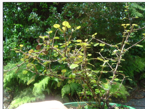
Caption: Coprosma spathulata subsp. spathulata