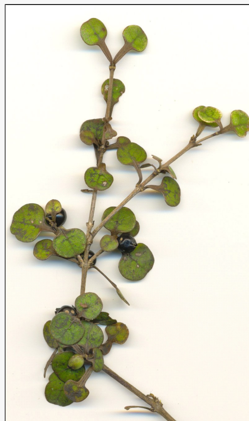
Caption: Coprosma spathulata subsp. spathulata

http://nzpcn.org.nz/flora_details.asp?ID=1738