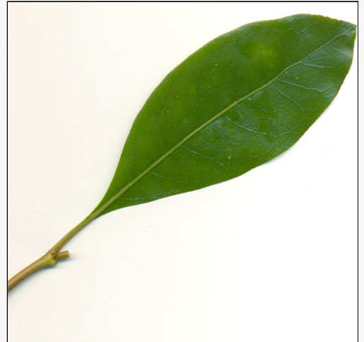
Caption: Leaf of Coprosma lucida