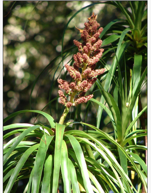
Caption: Awakino Scenic Reserve