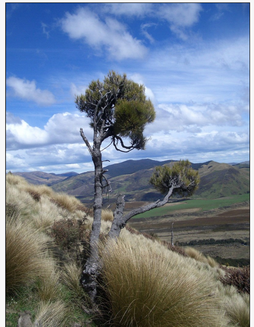
Caption: Takitimu Mountains, Southland