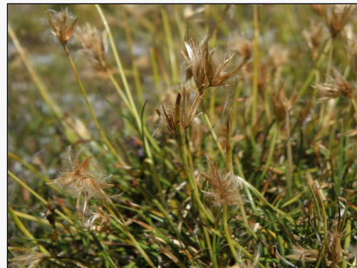
Caption: Lammermoor Range 1000m