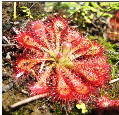
Caption: Drosera spatulata