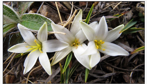
Caption: Lammerlaw Range

http://nzpcn.org.nz/flora_details.asp?ID=2152