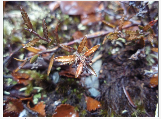
Caption: Mt Arthur

http://nzpcn.org.nz/flora_details.asp?ID=1917