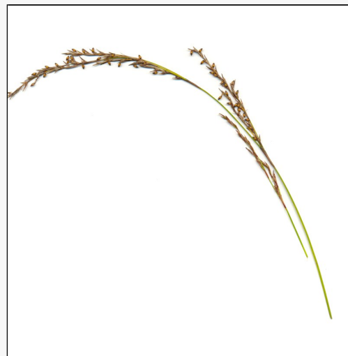
Caption: Machaerina tenax fruiting inflorescence

http://nzpcn.org.nz/flora_details.asp?ID=2068