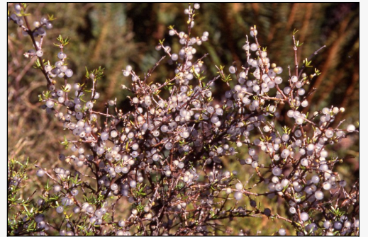
Caption: Coprosma rugosa