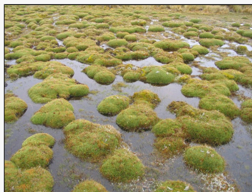
Caption: Oreobolus pectinatus , Hawkdun Range

http://nzpcn.org.nz/flora_details.asp?ID=1065