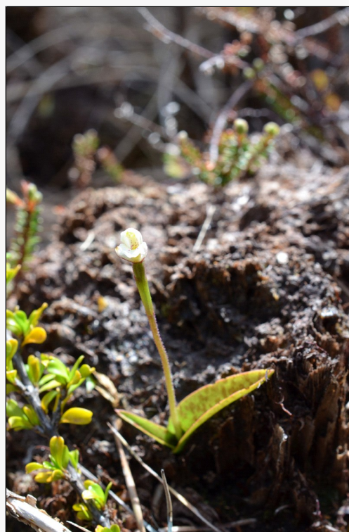
Caption: Auckland Island