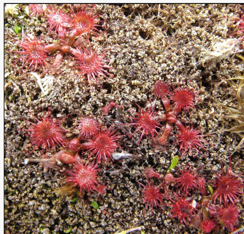
Caption: Lammerlaw Range

http://nzpcn.org.nz/flora_details.asp?ID=2116