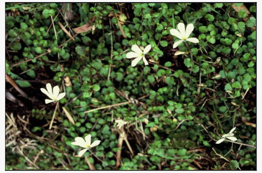
Caption: Bush on bank of Delvin's track

http://nzpcn.org.nz/flora_details.asp?ID=1189