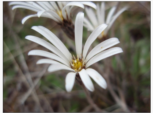
Caption: Cass, Canterbury