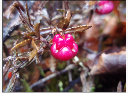
Caption: Mt Arthur