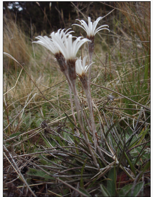
Caption: Cass, Canterbury

http://nzpcn.org.nz/flora_details.asp?ID=1621