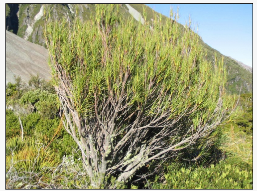
Caption: Mt Cook

http://nzpcn.org.nz/flora_details.asp?ID=1817