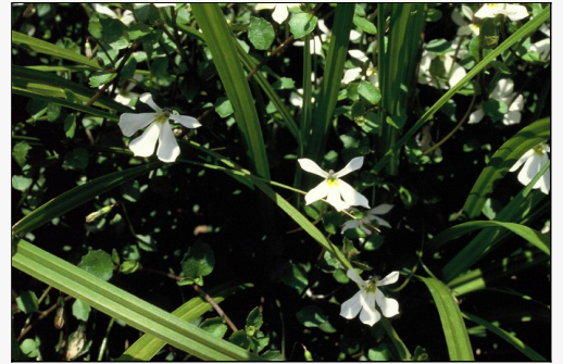
Caption: Lobelia angulata