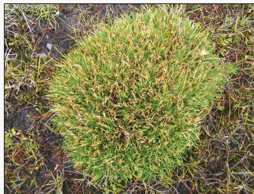
Caption: At Red Tarns, Mt Cook