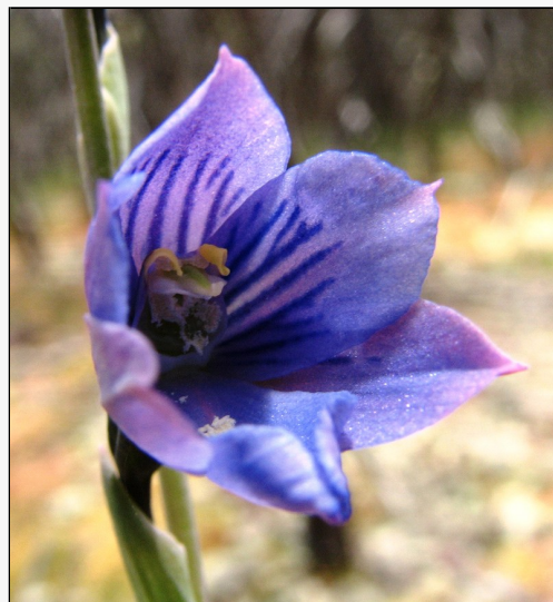
Caption: Thelymitra cyanea Photographer: Kevin Matthews

http://nzpcn.org.nz/flora_details.asp?ID=2271