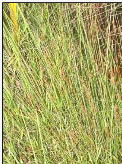
Caption: Machaerina tenax culms