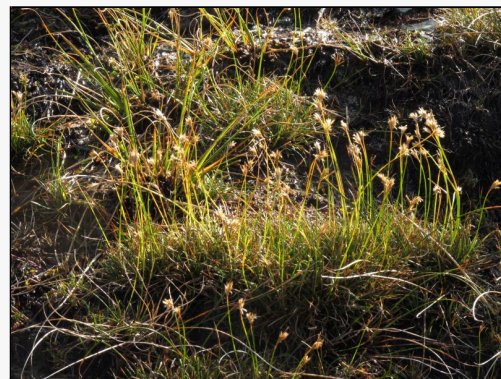
Caption: Steele Creek, Greenstone

http://nzpcn.org.nz/flora_details.asp?ID=1604