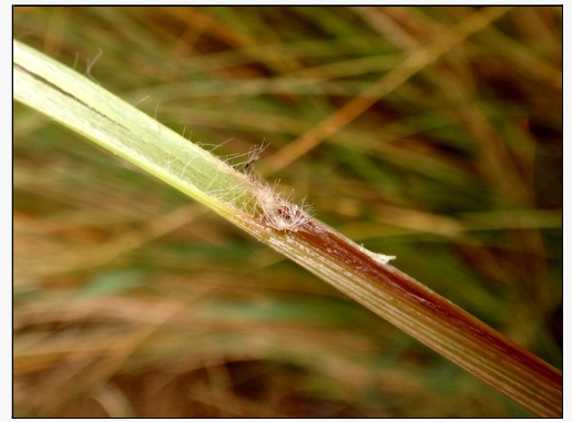
Caption: Kaiwera, Southland

http://nzpcn.org.nz/flora_details.asp?ID=1674