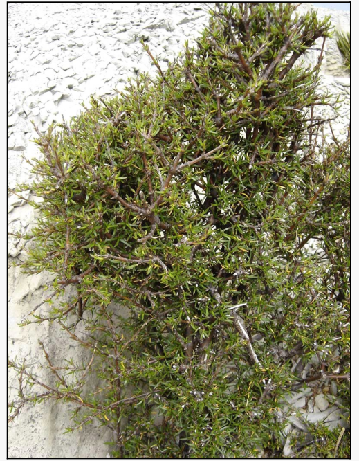
Caption: Coprosma rugosa

http://nzpcn.org.nz/flora_details.asp?ID=1736