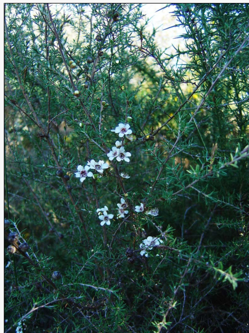
Caption: Flowers of Leptospermum scoparium var. scoparium