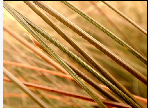
Caption: Kaiwera, Southland