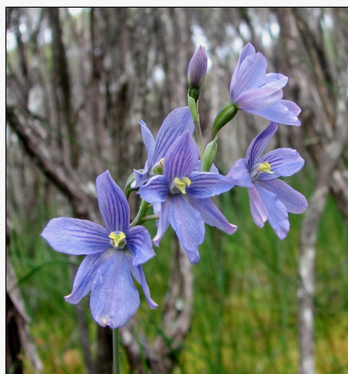
Caption: Thelymitra cyanea