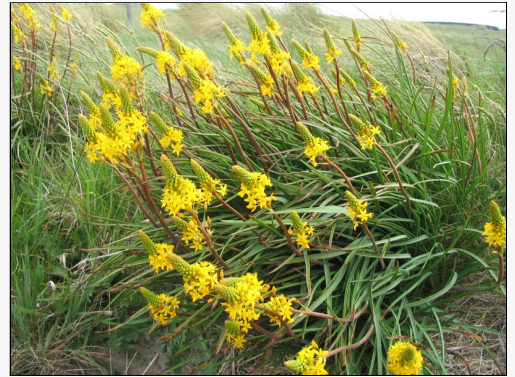
Caption: Old Woman Range