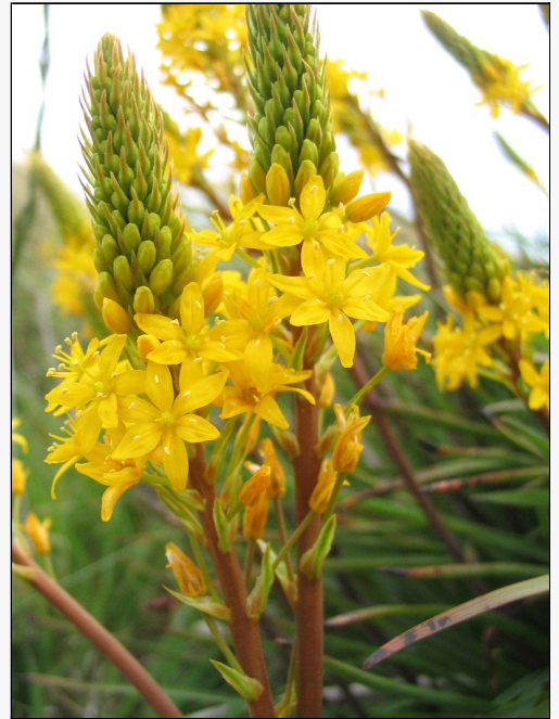
Caption: Old Woman Range

http://nzpcn.org.nz/flora_details.asp?ID=1576