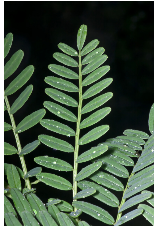
Leaf surface dull, not glossy. In cultivation.