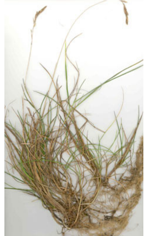
Pressed specimen. Photographer: Shannel Courtney, Licence: CC BY-NC.