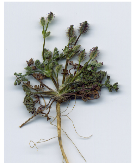
Upper Clutha Valley.