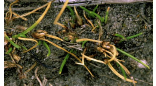
Close up of plants. Photographer: A. J. Townsend, Licence: CC BY-NC.