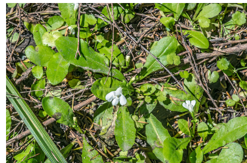
Tinui, Wairarapa.