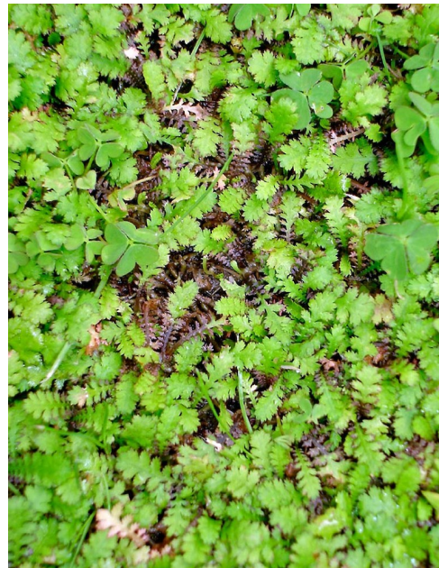
In cultivation ex Lake Kohangapiripiri. Dec 2006. Photographer: Peter J. de Lange, Licence: CC BY-NC.