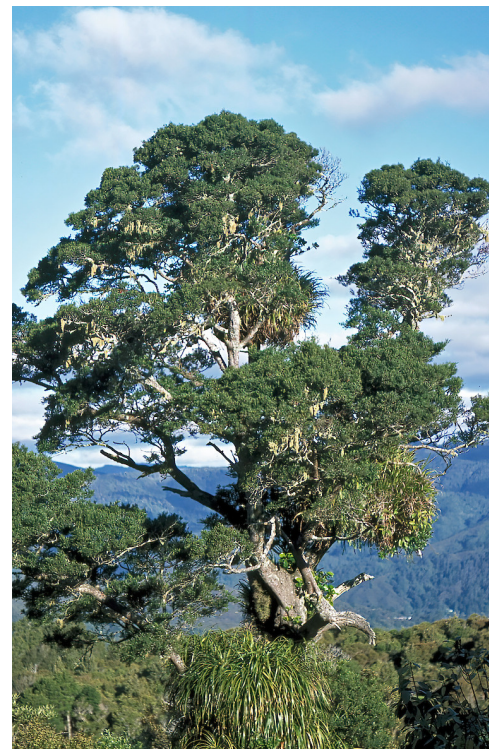
Eastern Hutt hills.