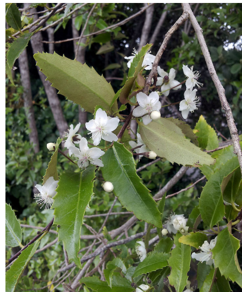
In cultivation ex Mount Burnett. Dec 2015. Photographer: Peter J. de Lange, Licence: CC BY-NC.