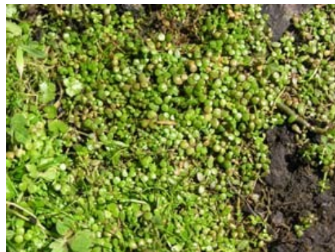
Hunua Falls, 15 Nov. 2005. Photographer: Mike Wilcox, Licence: All rights reserved.