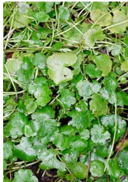
In cultivation ex Opuatia Wetland. Jul 2007.