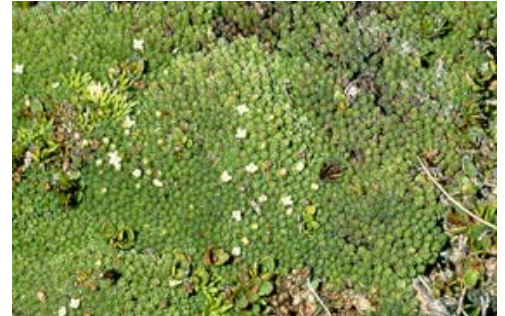
Old Man range, December.