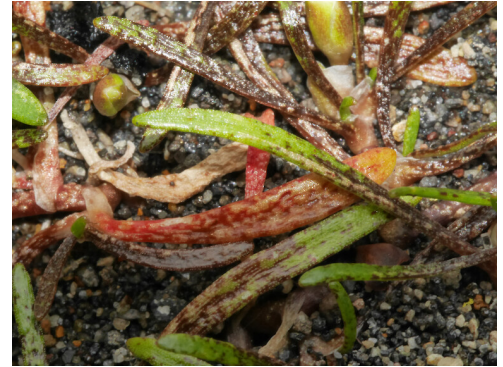
Desert Road, North Island. Photographer: Matt Ward, Date taken: 28/11/2021, Licence: CC BY-NC.