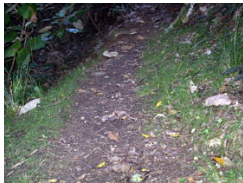
Poa matthewsii on trackside. Photographer: Alan Stewart, Licence: CC BY-NC.