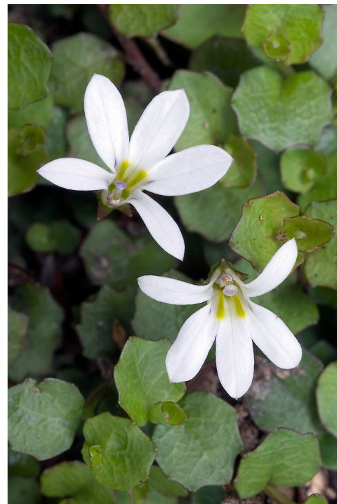
Stokes Valley, Lower Hutt.