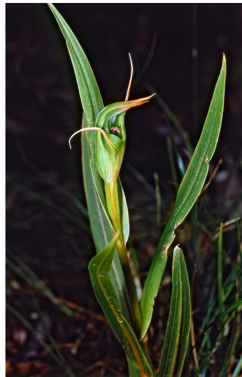
Eastbourne.