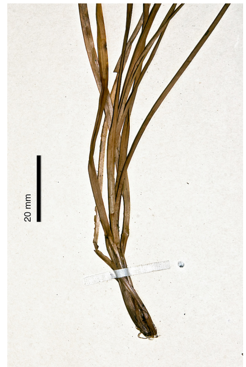
Herbarium specimen: AK 220518. Photographed with permission of Auckland