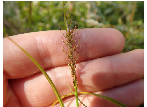
Photographer: Melissa Hutchison, Date taken: 20/02/2021, Licence: CC BY-NC.