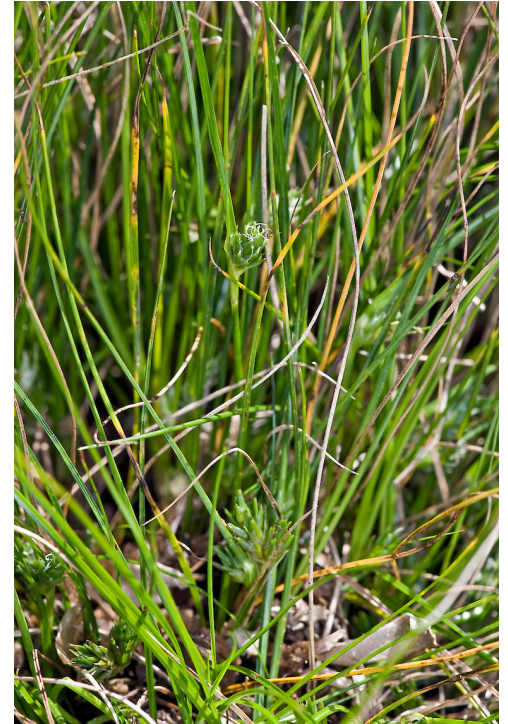
In cultivation ex Turakirae Head. Date taken: 19/10/2007, Licence: CC BY.