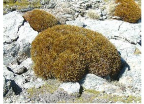
Rastus Burn, January.