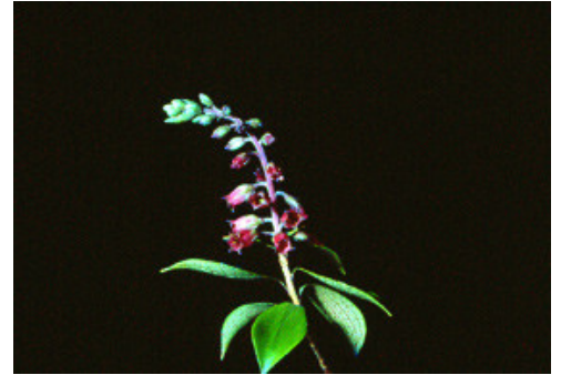
Mt Kaitarakihi, December.