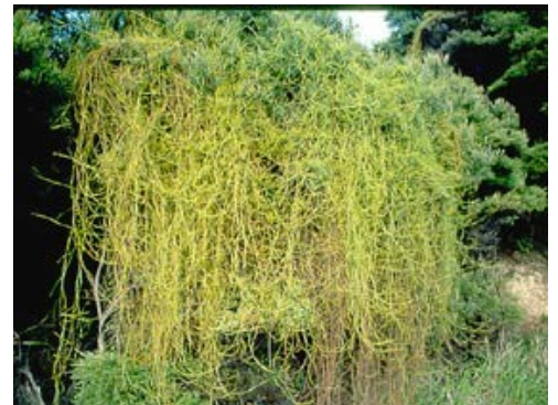
Waitiki, December.