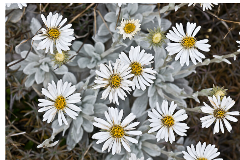
Mount Ruapehu.