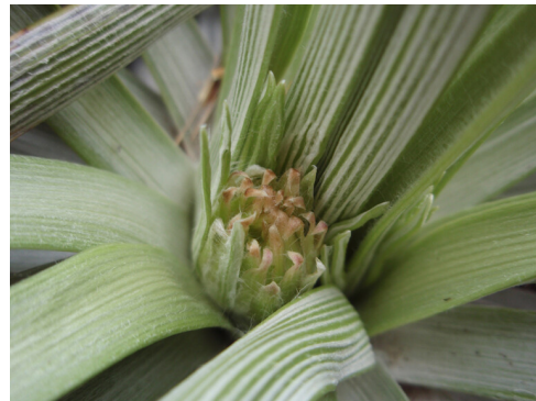
Craigieburn, Canterbury. Photographer: Jane Gosden, Licence: CC BY-NC-SA.