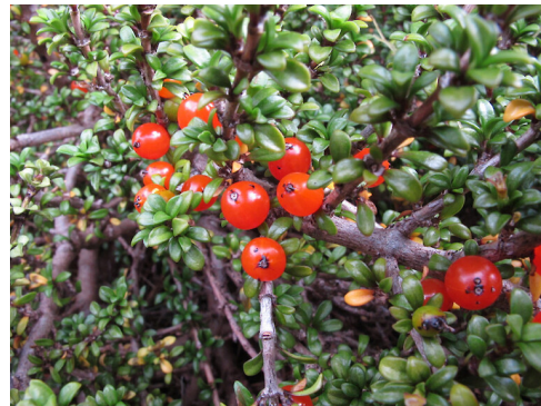
Minaret Burn, in fruit, March.