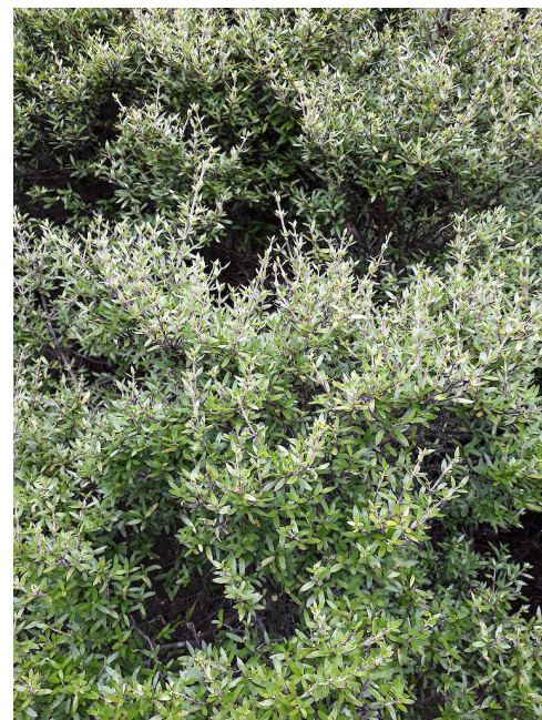
Shrub showing upright densely leafy branches typical of this variety. Harold Peirce Memorial Scenic Reserve, Waitangi West, Rēkohu (Chatham Island).