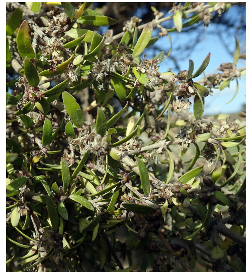
Male flowers (mostly spent) on shrub growing near North Road, Rēkohu (Chatham Island). Date taken: 21/09/2019, Licence: CC BY.