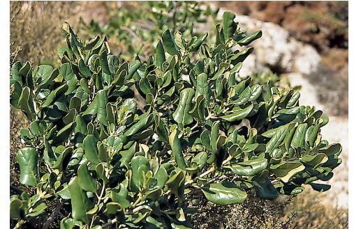
Eastbourne. Date taken: 08/06/2001, Licence: CC BY.