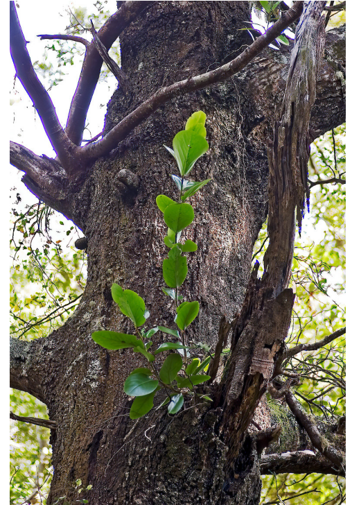
Silverstream, Upper Hutt.