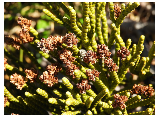
Seed capsules, Mount Burns, Fiordland. Photographer: Jesse Bythell, Date taken: 12/01/2019, Licence: CC BY-NC.