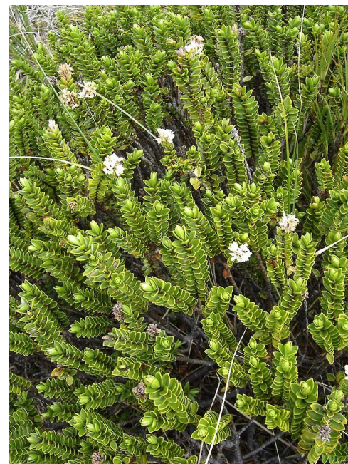
Hebe masoniae.