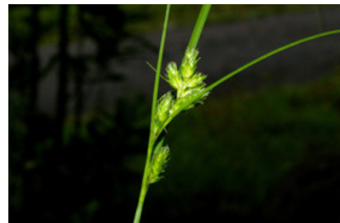
Carex inversa.