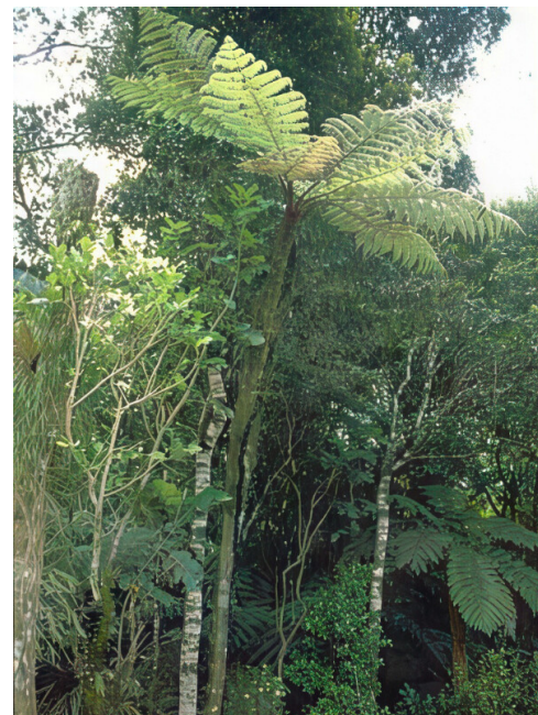
Cyathea cunninghamii.