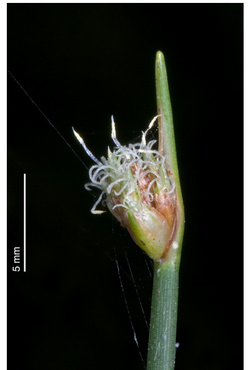
Flowering spikelet. Maungaraho Rock.